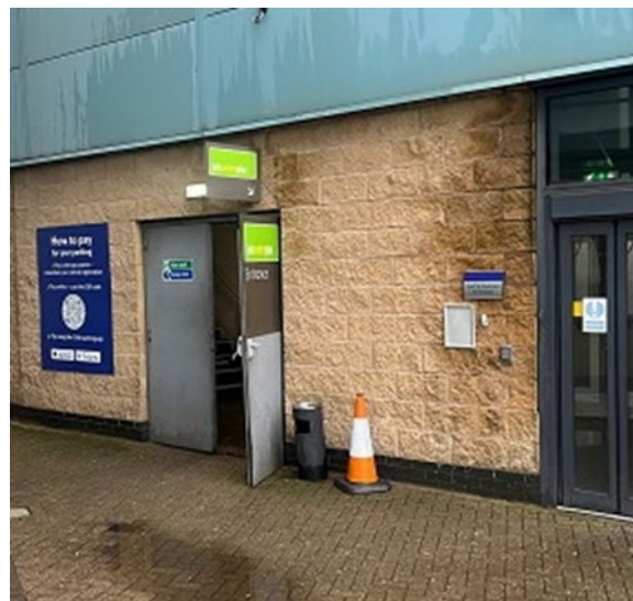
Unloading/Loading Area at Rear Entrance by Park B and Entrance to Goods Lift in this area